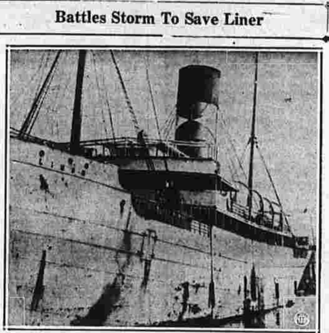
Battles Storm To Save Liner